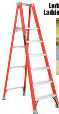
Ladders & Ladder Safety