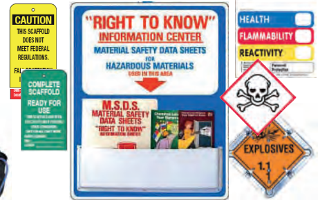
Warning Labels & Hazard Communication